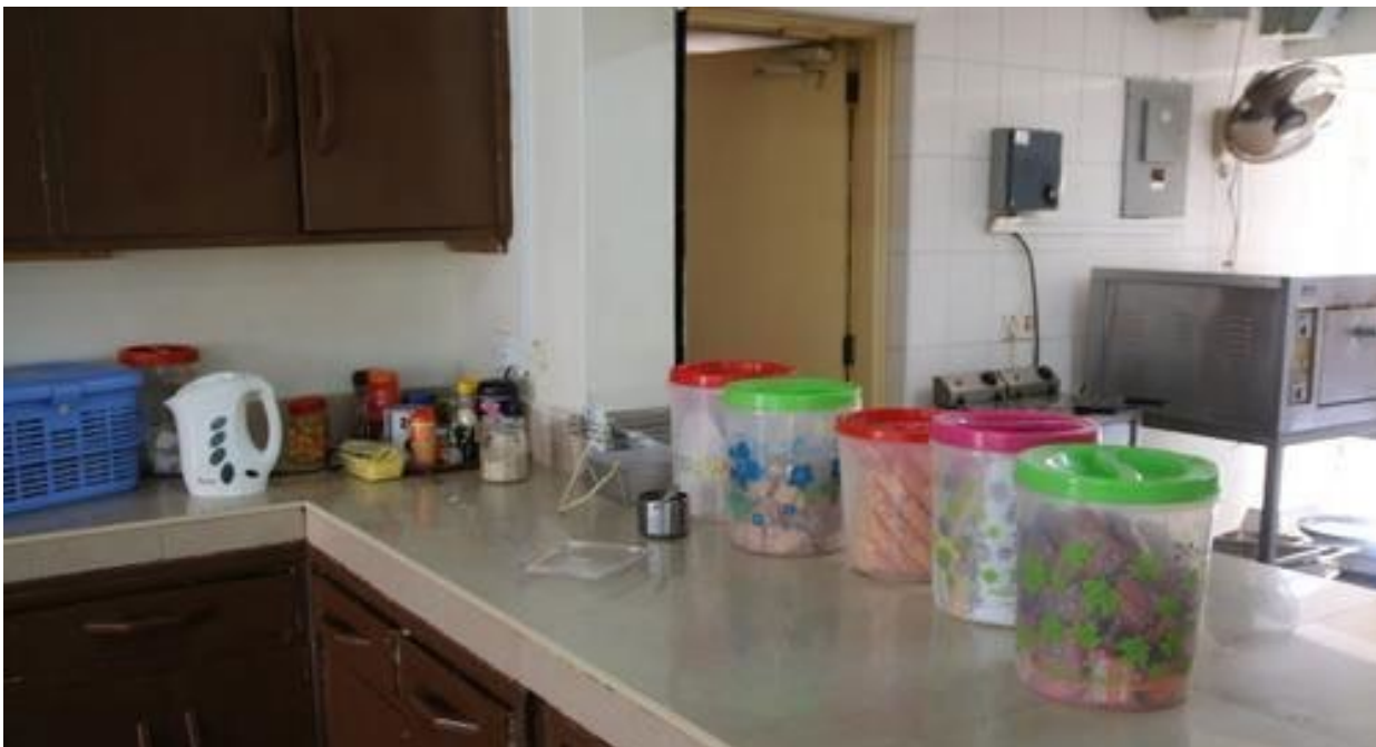
Breakfast at IU House is continental style.