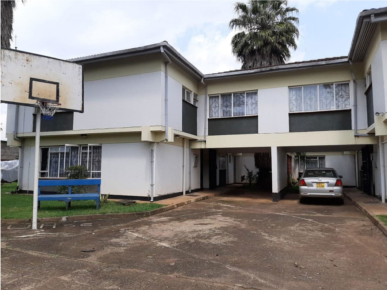
Houses 3 & 4

Short-term housing is available in houses 1-4. Inside each of these houses are four rooms: one master bedroom with an ensuite bathroom and three rooms with a shared bathroom. Master bedrooms are not available to trainees. The number of beds in the three rooms varies from 1-4. Servants Quarters (SQs) are rooms with outdoor entrances and a separate, shared bathroom are also available.