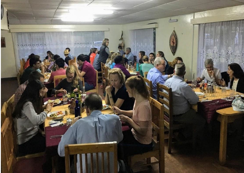
Dining Room at IU House