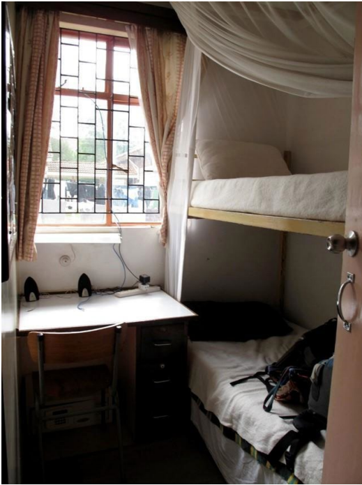
Aerial view of bunk and floor space