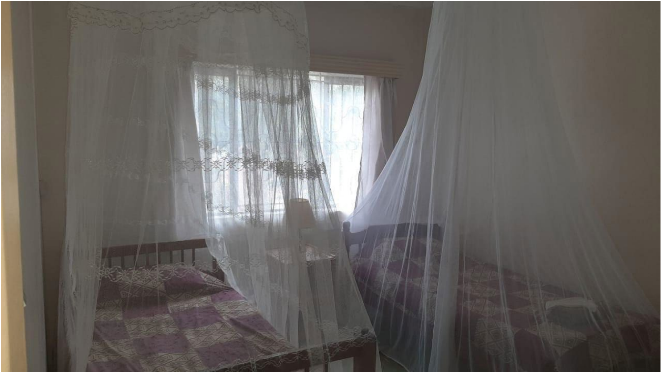
Room with two twin beds (Houses 1-4)