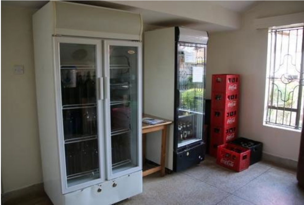
Clean water refrigerator (included and always available) and refrigerator for soft drinks and beer (available for purchase) at IU House