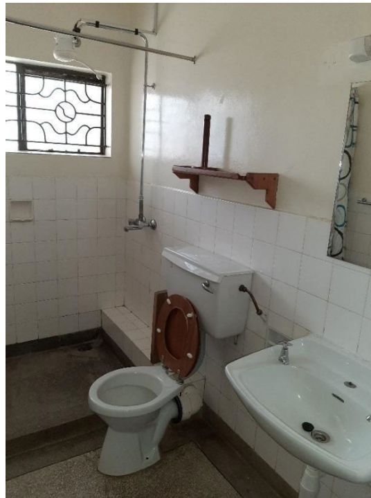
Shared bathrooms, with and without a tub (Houses 1-4)