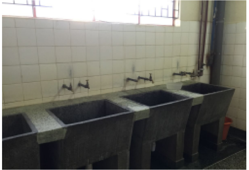
Laundry/dish washing room