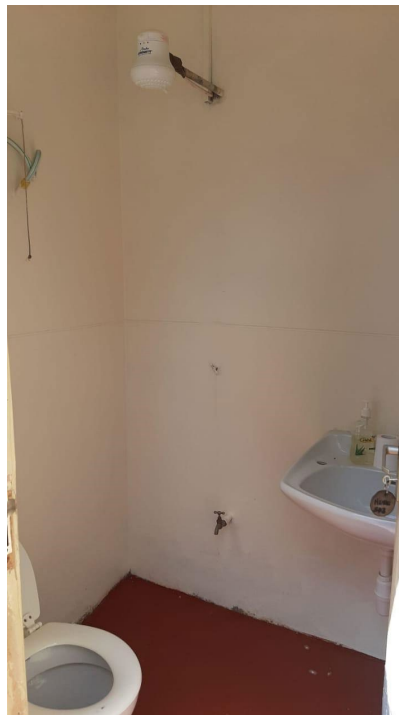
SQ bathroom: Shower and toilet area are in one combined room. No bathtub.