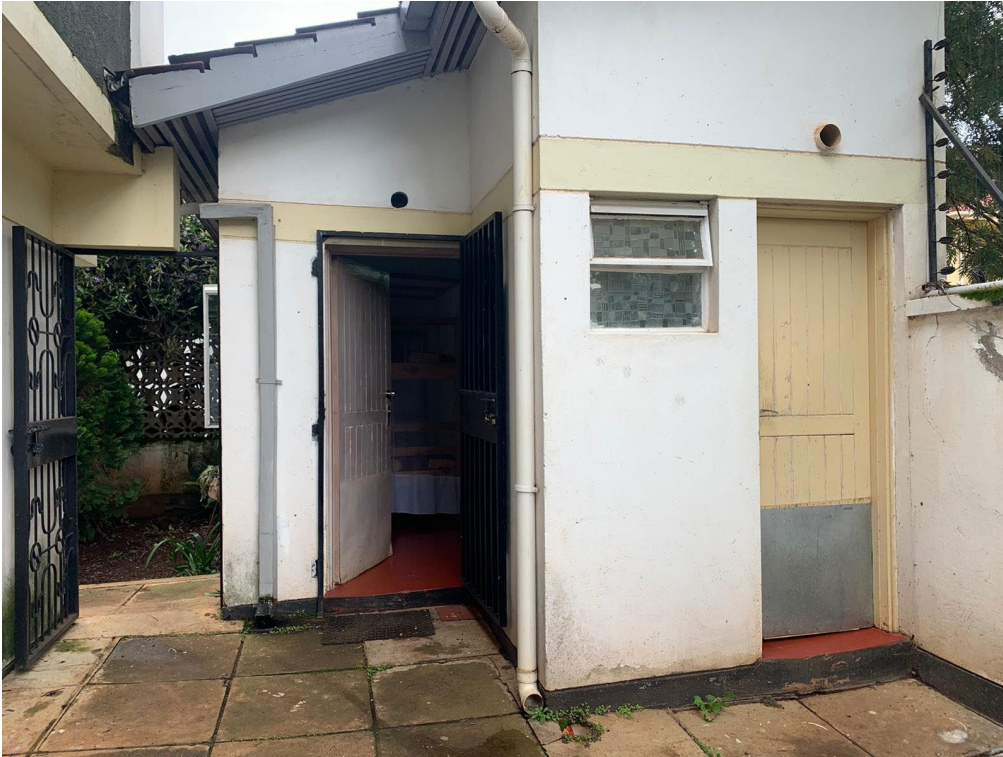
SQ room exterior & bathroom exterior