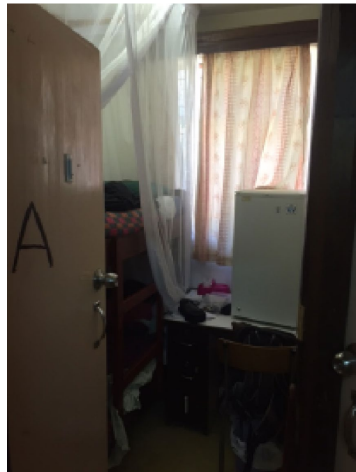
Room A (with fridge)