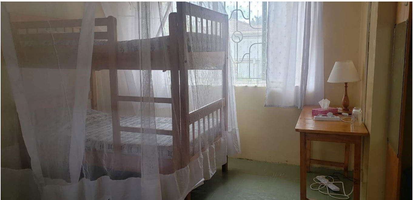
Room with one bunk bed (Houses 1-4)