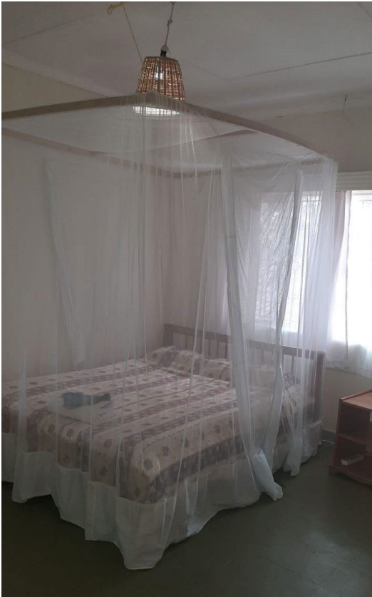
Room with one double bed (Houses 1-4)