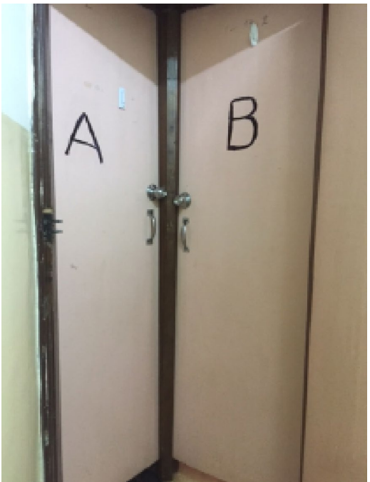
Entry to hostel rooms